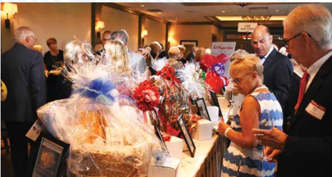
Red Wagon Gala guests review raffle baskets and live auction bid items.