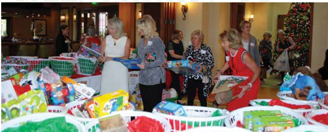
Members arriving at Christmas Party with their gifts. Story, more photos on page 2.